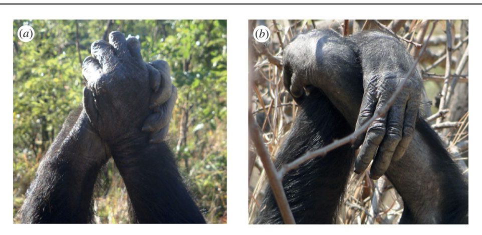
Figure 1. Grooming handclasp style examples: (a) palm-to-palm and (b) wrist-to-wrist.