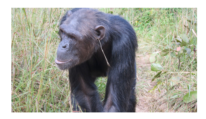
Fig. 1 Julie (the inventor) performing the grass-in-ear behaviour

"Grass-in-ear behaviour" (henceforth "GIEB") was first documented in 2010 when the first author observed one female chimpanzee (Julie) repeatedly putting a stiff, straw-like blade of grass in one or both of her ears. She left the grass hanging out of her ear(s) during subsequent behaviour such as grooming, playing, and resting (Figs. 1, 2 and Online Resource 1); the behaviour served no discernible purpose.