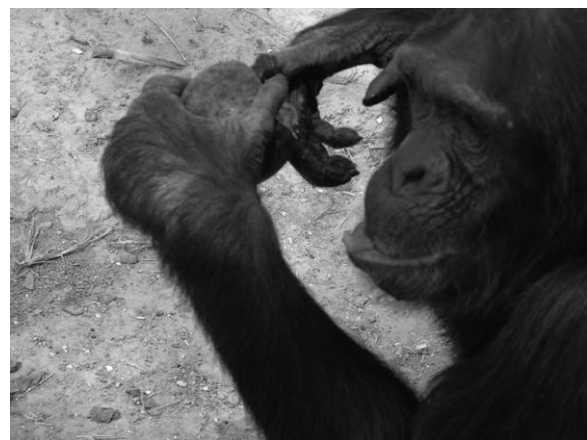
Fig. 1. Bimanual coordinated feeding behavior by a chimpanzee (Kambo) at Chimfunshi.

For measures of handedness, we calculated the frequency of dominant hand actions for bouts. Bouts began when one hand reached for an object for manipulation. Once the item was gathered, only the first manipulative action was coded for hand dominance. A bout ended when the focal animal released the object. There is on-going discussion in the literature regarding whether events or bouts represent the most valid measure for evaluating hand dominance (McGrew and Marchant, 1997; Hopkins et al., 2001). While some purport a statistical bias may result from the dependence of the data between each hand use response (e.g., pseudo-replication; see Hurlburt,